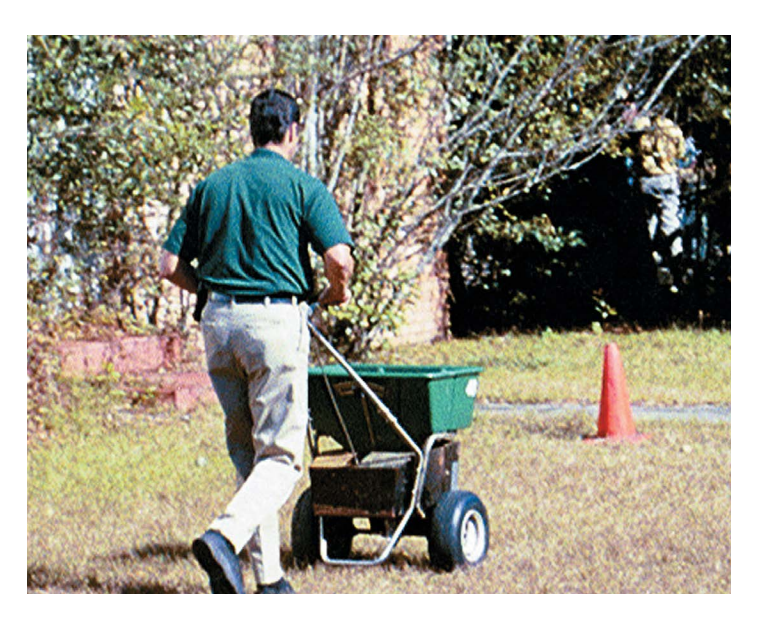
Figure 26. Calibrate spreaders frequently.

The proper application of pesticides helps to reduce costs and increase profits. Improper application can result in wasted chemicals, marginal pest control, excessive carryover, or damage to turf or landscape ornamentals. As a result, inaccurate application is usually very expensive.