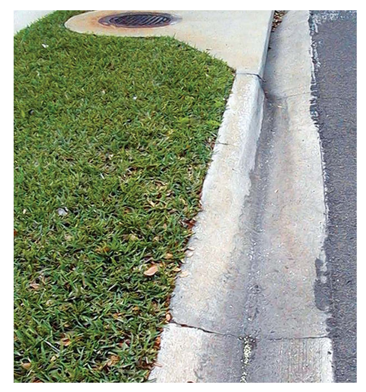
Figure 19. Slow or quick release, this fertilizer is going to a water body. Keep fertilizer away from impervious surfaces and water bodies.

• Triazone is a water soluble compound of formula C5H11N5O2 [5-(N-methyl)-urea-1,3,5-triazin-2-one or 5-methyleneureido-2oxohexahydro-s-triazine] which contains at least forty percent (40%) total nitrogen. (AAPFCO, Official 1989)