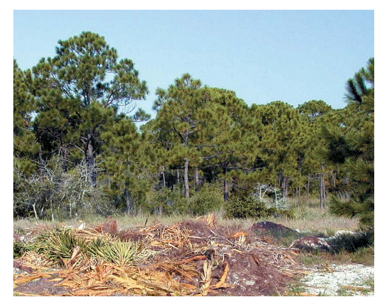
Figure 9. Illegal dumping of plant material.

• Whenever practical, and if the homeowner is amenable, yard wastes should be composted on-site and retained for use as mulch. This also avoids transportation and disposal costs and reduces the need for purchased materials.