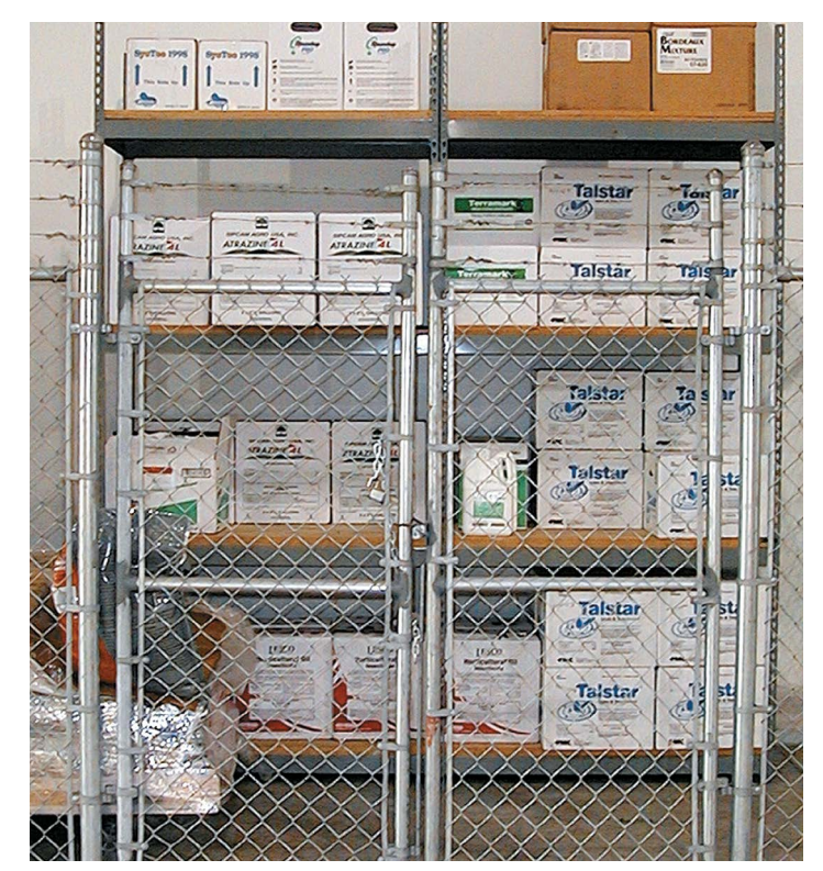
Figure 25. Pesticide storage areas should be locked.

Depending on the products stored and the quantity, you may need to register the facility with the Florida Department of Community Affairs and your local emergency response agency. Check with your pesticide dealer about community right-toknow laws for the materials that you purchase. An emergency response plan should be in place and familiar to personnel before an emergency occurs, such as a lightning strike, fire, or hurricane. Individuals conducting emergency pesticide cleanups should be properly trained under the requirements of the federal Occupational Safety and Health Administration (OSHA). For reporting chemical spills, see the section on spill reporting requirements later in this chapter.