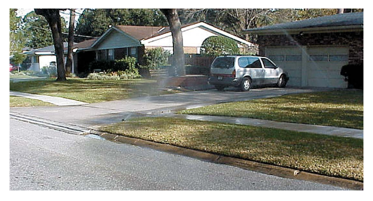
Figure 14. Overirrigation, runoff. Small turf area should be irrigated with spray heads, nt rotors.