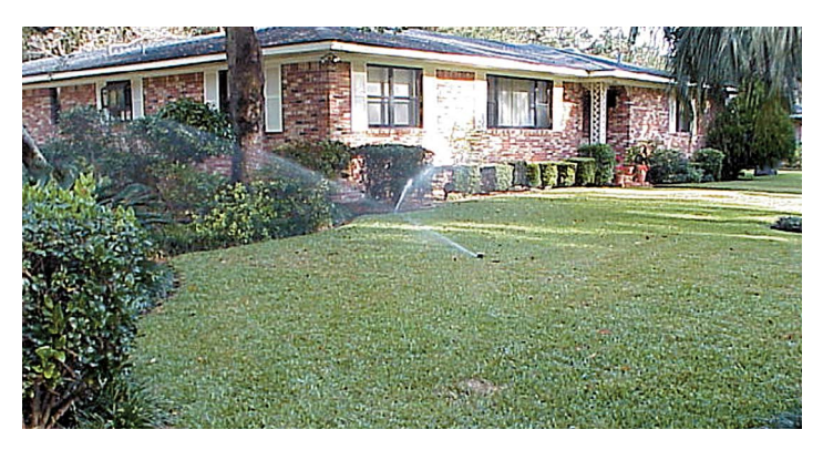
Figure 13. Poor design; system does not match irrigation requirements. The area needs to be rezoned with landscape and turf separated.