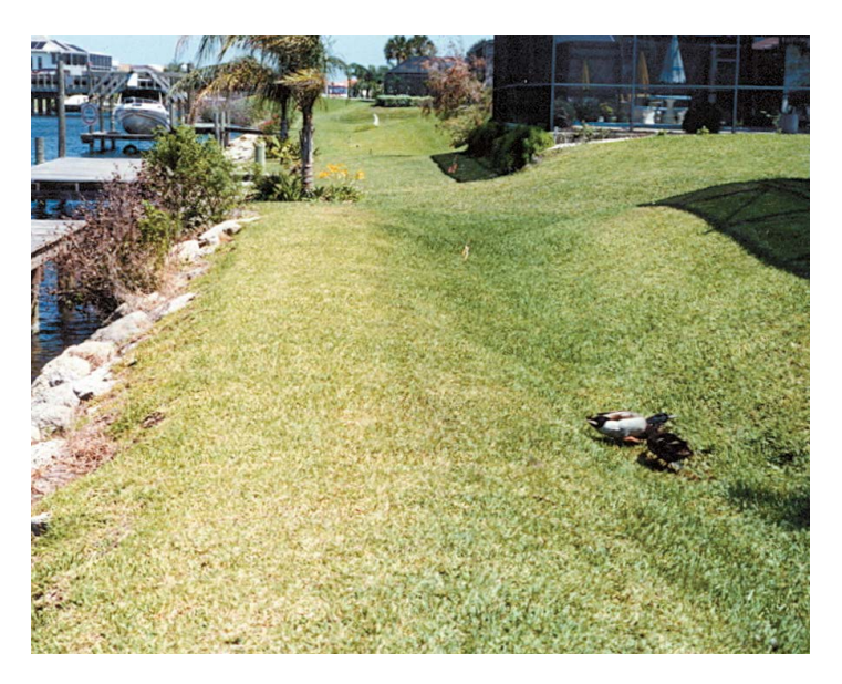
Figure 20. Leave a "Ring of Responsibility" to prevent pollution. Also note the swale and berm.

There is no significant difference between liquid or dry applications. Turfgrasses take up N in the form of nitrate and ammonium, and all dry fertilizers have to be dissolved by water before they benefit the turf. In terms of BMPs for environmental protection, the proper application of fertilizer is more important than the type of product.