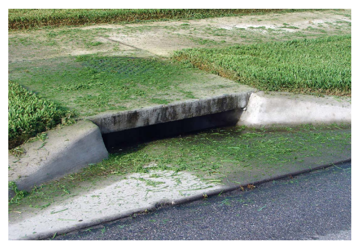
Figure 8. Always remove clippings from impervious surfaces. These nutrients are going straight to a water body.