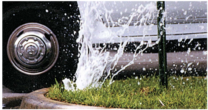
Figure 16. Water gushing from broken head.