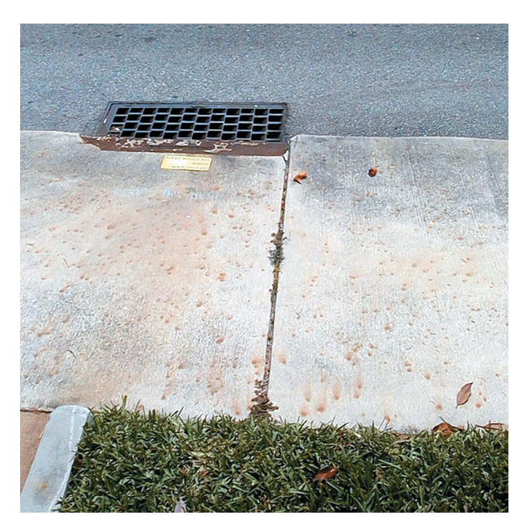
Figure 3. Poor fertilization technique wastes fertilizer, causes unsightly stains, and pollutes our waterbodies.

The average volume of rainfall in Florida ranges from 40 inches annually in Key West to about 53 inches in the central and northern peninsula and over 60 inches in the Panhandle