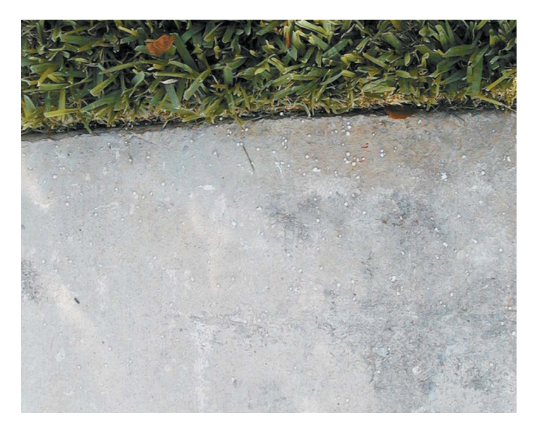
Figure 22. Fertilizer on sidewalks runs off into storm drains. Sweep it into the grass.

Fertigation is the application of liquid fertilizer through irrigation systems. While fertigation is not widely practiced in residential or commercial lawn and landscape care, some systems are available. For effective nutrient management to be achieved, a fertigation system should be designed, installed, and maintained by a qualified irrigation specialist. Proper and legal backflow prevention devices must be used so that fertilizer does not back-siphon into the water supply. Apply minimum quantities of fertilizer. Due to the hazards of direct deposition on streets, driveways, and sidewalks; and potential over-application by misadjusted irrigation systems; FDEP does not recommend use of fertigation for residential use unless the entire system is under an operation and maintenance contract with a reputable contractor who is fully responsible for any pollution due to improper operation of the fertigation equipment or the associated irrigation system.