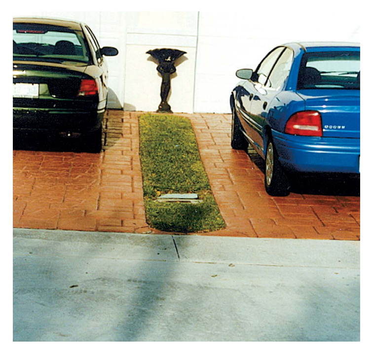
Figure 4. Narrow strips are difficult to maintain.

• Soil amendments—add these prior to planting if you need to improve the soil's physical and chemical properties.