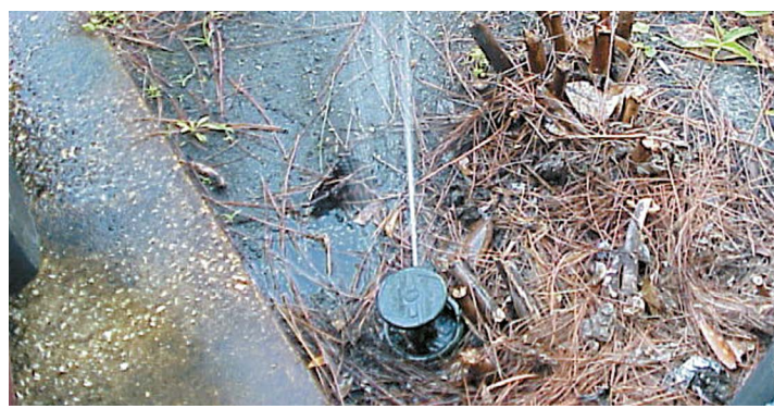
Figure 15. Object is interfering with spray pattern, resulting in poor distribution uniformity