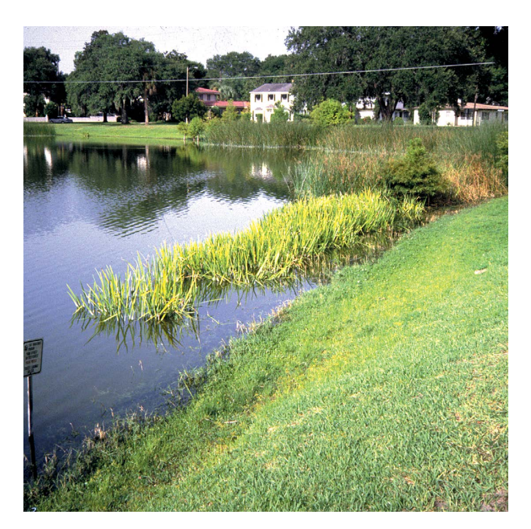
Figure 1. With proper BMPs, our water resources can successfully coexist with residential landscapes.

Since the original publication of this BMP manual, several new laws have been passed, new research completed, and new products developed. Therefore, this 2020 printing contains new information in many areas, especially concerning irrigation systems and fertilizer use, along with many other suggestions