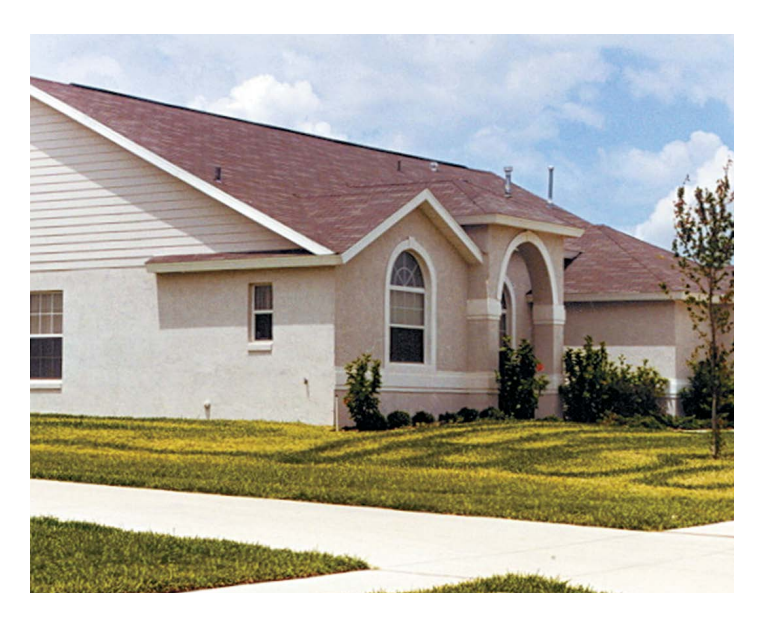
Figure 17. Streaking on a lawn caused by poor application technique.

Additional information on soil testing for turfgrasses can be found later in this chapter or in IFAS Publication SL 181, Soil Testing and Interpretation for Florida Turfgrasses , at <u>http://edis.ifas.ufl.edu/SS317</u>