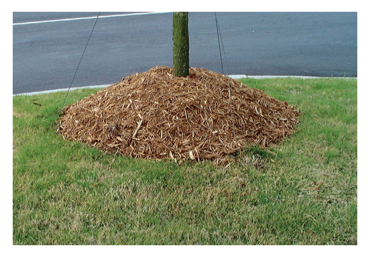
Figure 6. Never build volcanoes. This crown will rot and the roots are smothered.