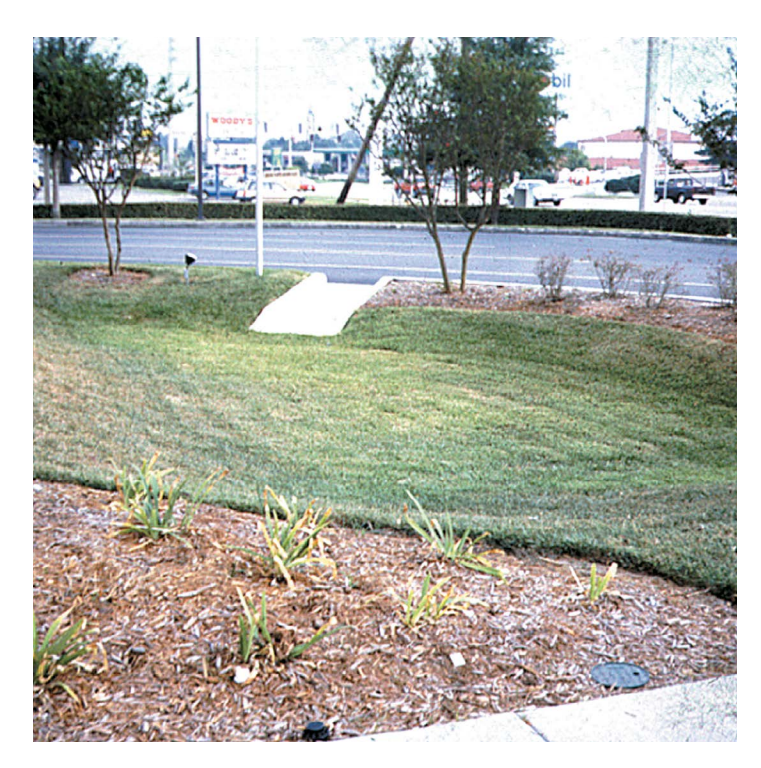
Figure 2. Grassy stormwater retention areas can add to a lawn and protect our environment.