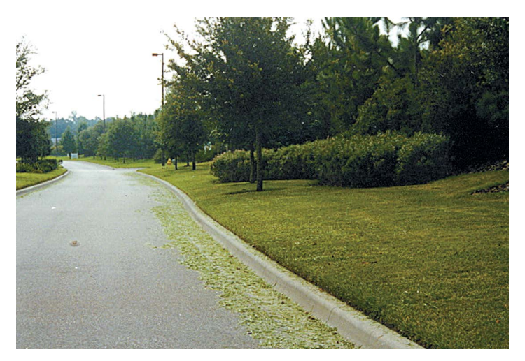
Figure 7.This is BAD! Never direct clippings into the street where they can enter the storm drain system.

Mowing equipment and string trimmers can damage trees. Tree trunks that are bumped by mowers, or trees that are used as pivot points for turns, are injured via contact. Mechanical damage to trees can cause progressively bigger wounds, since the trees are hit in the same general area repeatedly over time. The damage eventually progresses through the phloem, cambium, and xylem of the tree. In a worst-case scenario, the tree is girdled and dies. Those trees not killed are stressed and the wounds end up as an entry point for disease and insect infestation. The whipping action of the nylon string on a trimmer can debark a young tree quickly, causing its demise.