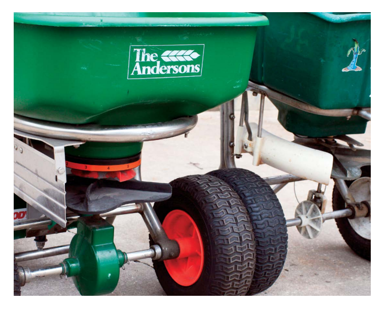
Figure 21. Spreaders with deflector shields.