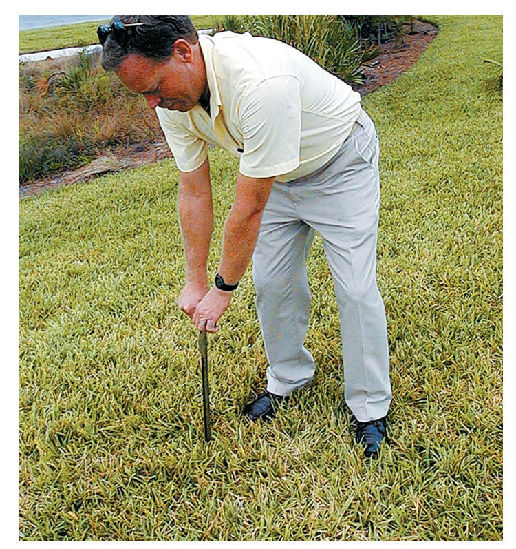
Figure 23. Taking a soil sample.

Although it may not be an essential practice for the everyday maintenance of a healthy landscape, testing to determine the soil's chemical properties before installing turfgrass or landscape plants is a recommended practice. Through soil testing, the initial soil pH and P level can be determined. Soil pH is important in determining which turfgrass is most adapted to initial soil conditions (bahiagrass and centipedegrass are not well adapted to soil with a pH greater than 7.0). Since it is not easy to reduce the pH of soil on a long-term basis, you should use St. Augustinegrass or bermudagrass on high-pH soils.