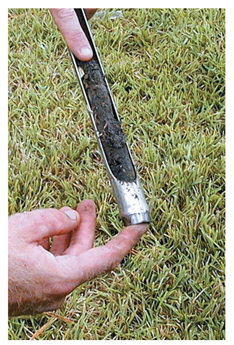
Figure 24. Soil Core.