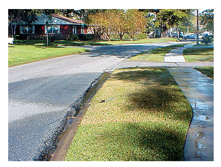
Figure 12. Poor design; sprinkler does not match area.

The following figures depict some examples of improper irrigation system design or installation.