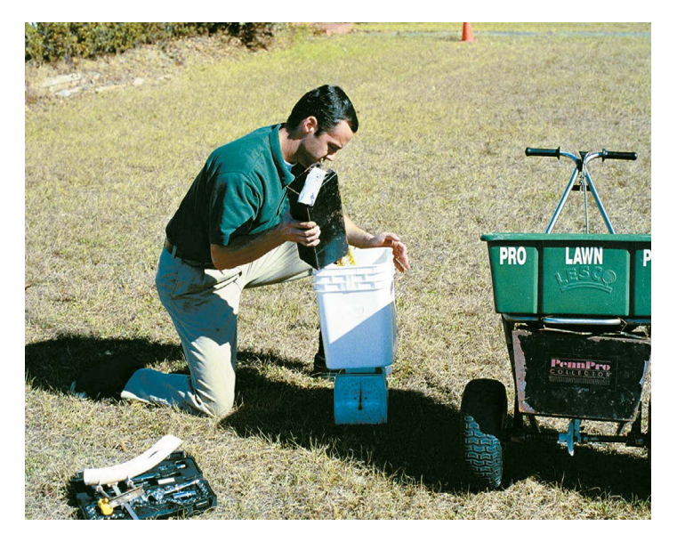
Figure 18. Weigh fertilizer to get accurate results.

that these stabilized N materials extend the N availability to turfgrass for 10 to 14 days over that of quick release products.