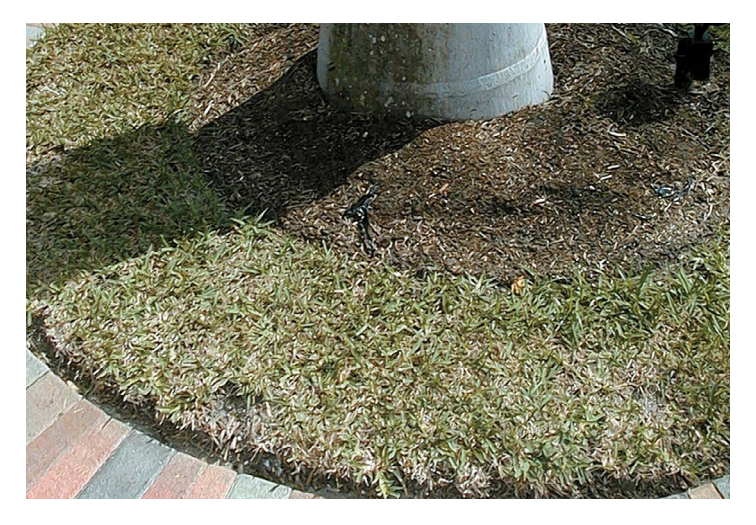
Figure 5. Mulch, not grass, should be used here.

http://gardeningsolutions.ifas.ufl.edu/care/planting/mulch. html